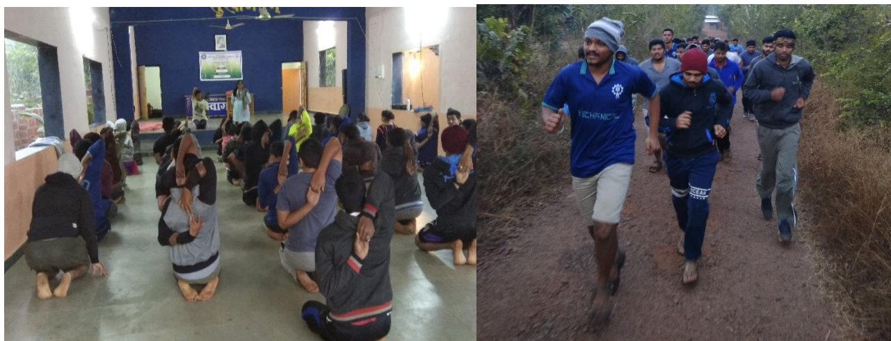
Students during morning yoga and running