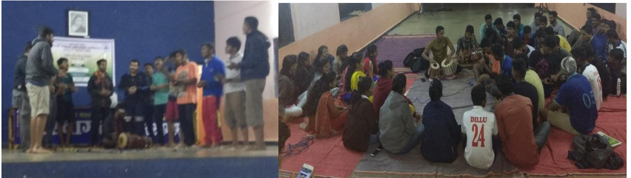
Students participated in cultural activities