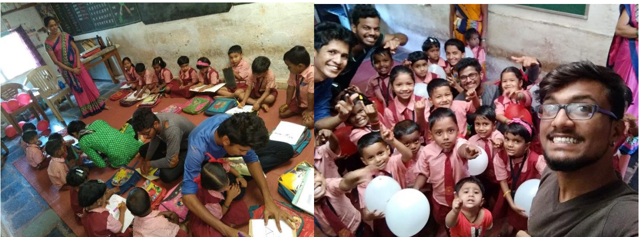
Students during activities in primary school