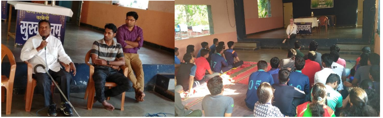
Students attending lectures by guest speakers